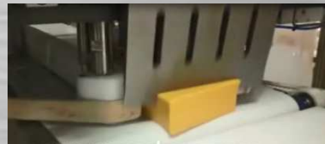
Triangles in logs