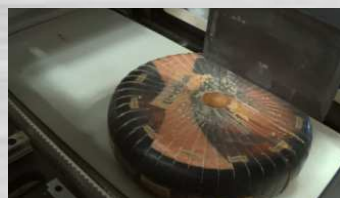
Round wheels 180 to 400 mm diameter in wedges